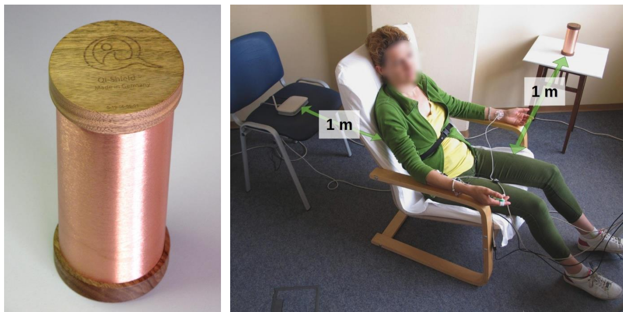
Figure 1: (a) Specimen of the Qi-Shield device used for testing (left). (b) During the measurements volunteers sat in a comfortable wooden chair with electrodes attached to both hands and Qi-Shield and Wi-Fi router placed 1 m away from them (right).