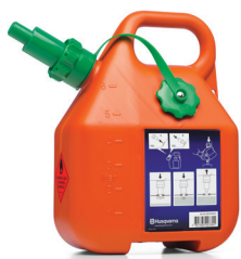
PETROL CAN 6 LITRES, ORANGE 505 69 80-01