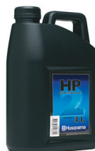
TWO STROKE OIL, HP 587 80 85-20