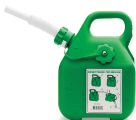
PETROL CAN GREEN 505 69 80-40