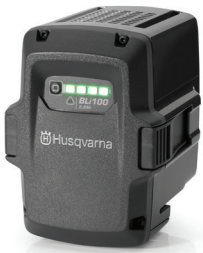
HUSQVARNA BATTERY BLI100 967 09 18-01