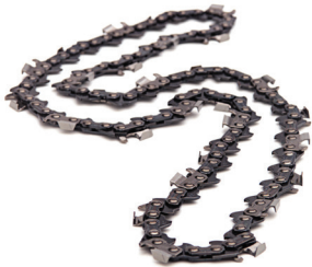
SAW CHAIN H00 1/4" 1.3 MM 501 84 40-64