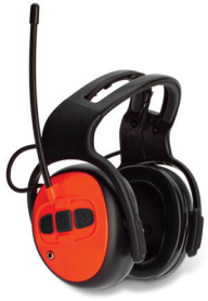
HEARING PROTECTION WITH FM RADIO 578 27 49-01