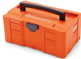
HUSQVARNA BATTERY BOX L 585 42 88-01