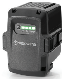
HUSQVARNA BATTERY BLI200 967 09 19-01