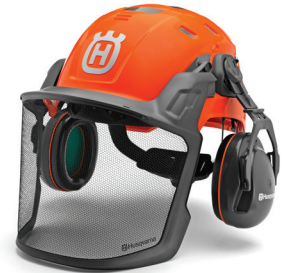
FOREST HELMET, TECHNICAL 585 05 84-01