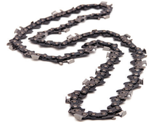
SAW CHAIN H37 CHAMFER CHISEL 3/8" MINI 1.3 576 93 65-40