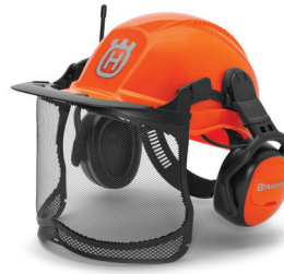
FOREST HELMET FUNCTIONAL, WITH FM RADIO 581 04 07-01