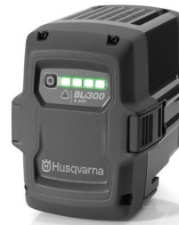
HUSQVARNA BATTERY BLI300 967 07 19-01