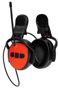
HEARING PROTECTION WITH FM RADIO 578 27 49-02