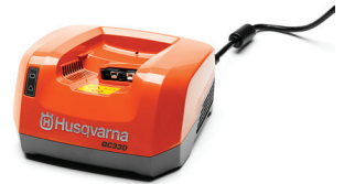
HUSQVARNA CHARGER QC330 967 09 14-01