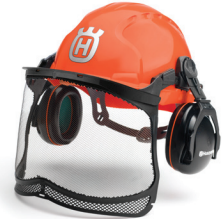
FOREST HELMET, CLASSIC 580 75 43-01