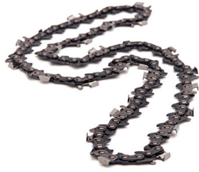
SAW CHAIN H37 CHAMFER CHISEL 3/8" MINI 1.3 576 93 65-52