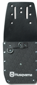
COMBI HOLSTER 505 69 16-05