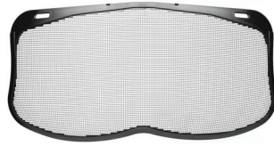
MESH VISOR, METAL 505 66 53-21