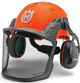
FOREST HELMET, TECHNICAL 585 05 84-01