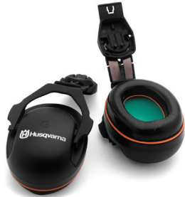
HEARING PROTECTORS, H200 AND ALVEO 505 66 53-25