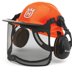
FOREST HELMET, FUNCTIONAL 576 41 24-02