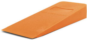
FELLING WEDGES 505 69 47-03