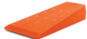
FELLING WEDGES 505 69 47-02