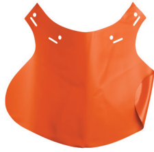
NECK GUARD 505 66 53-06