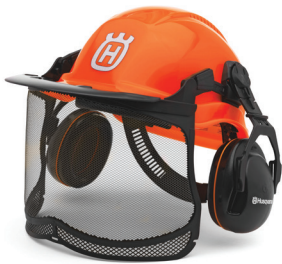
FOREST HELMET, FUNCTIONAL 576 41 24-01