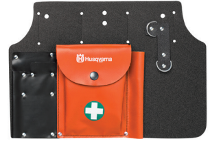
REAR TOOL CARRIER 505 69 05-10