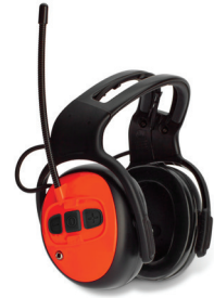
HEARING PROTECTION WITH FM RADIO 578 27 49-01