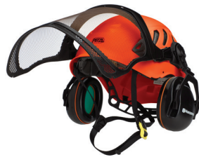
ARBORIST HELMET, TECHNICAL 578 09 23-01