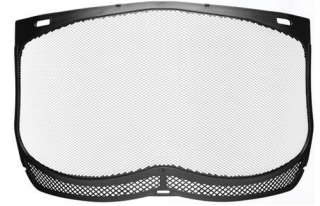
ULTRAVISION VISOR 574 61 35-01