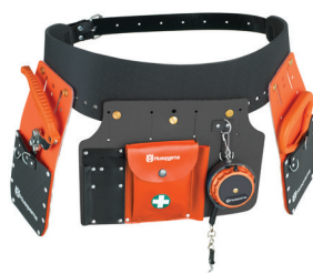
TOOL BELT KIT 505 69 90-15