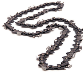
SAW CHAIN H37 CHAMFER CHISEL 3/8" MINI 1.3 576 93 65-56