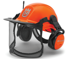
FOREST HELMET FUNCTIONAL, WITH FM RADIO 581 04 07-01