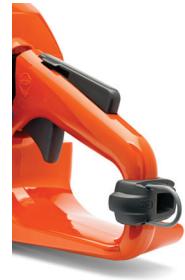
EYELET 578 07 71-01