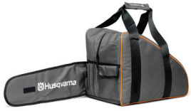
CHAINSAW BAG 576 85 91-01