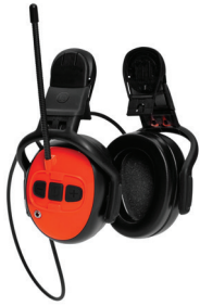
HEARING PROTECTION WITH FM RADIO 578 27 49-02