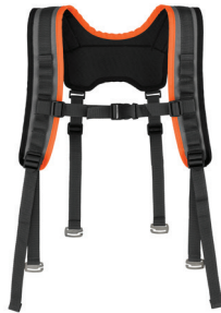
HARNES 593 83 76-01