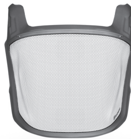
FREE VIEW VISOR 586 40 96-01