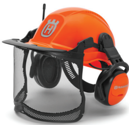
FOREST HELMET FUNCTIONAL, WITH FM RADIO 581 04 07-01