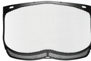
ULTRAVISION VISOR 574 61 35-01