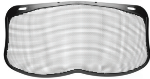
MESH VISOR, METAL 505 66 53-21