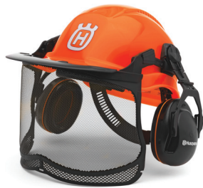
FOREST HELMET, FUNCTIONAL 576 41 24-02