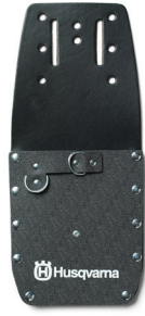
COMBI HOLSTER 505 69 16-05