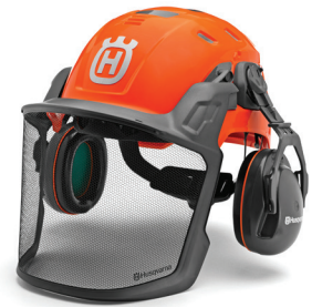
FOREST HELMET, TECHNICAL 585 05 84-01