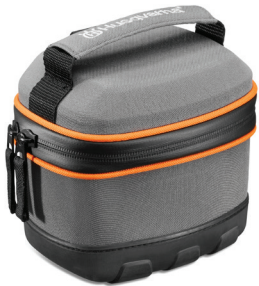
HUSQVARNA BATTERY BAG 585 37 18-01