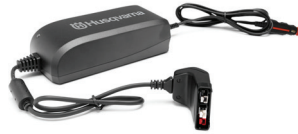
HUSQVARNA CHARGER QC80F 967 62 83-01