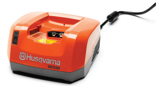
HUSQVARNA CHARGER QC330 967 09 14-01