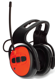
HEARING PROTECTION WITH FM RADIO 578 27 49-01