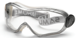
PROTECTIVE GLASSES, GOGGLES 544 96 39-01