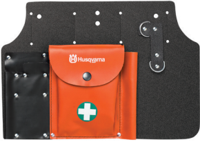
REAR TOOL CARRIER 505 69 05-10