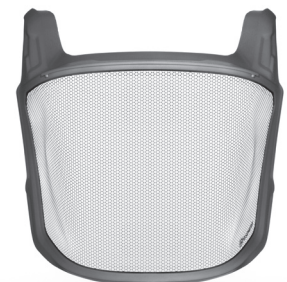
FREE VIEW VISOR 586 40 96-01