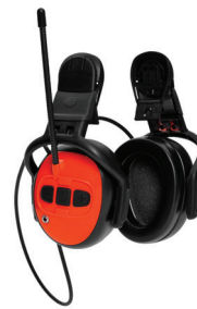
HEARING PROTECTION WITH FM RADIO 578 27 49-02