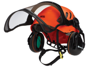
ARBORIST HELMET, TECHNICAL 578 09 23-01