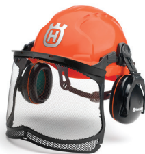
FOREST HELMET, CLASSIC 580 75 43-01