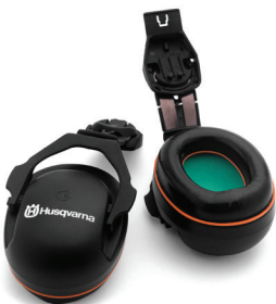
HEARING PROTECTORS, H200 AND ALVEO 505 66 53-25