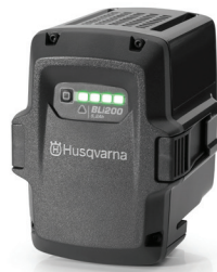
HUSQVARNA BATTERY BLI200 967 09 19-01