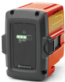
HUSQVARNA BATTERY BLI20 967 09 17-01