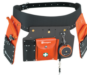
TOOL BELT KIT 505 69 90-15