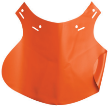
NECK GUARD 505 66 53-06