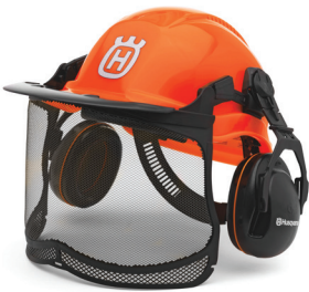
FOREST HELMET, FUNCTIONAL 576 41 24-01