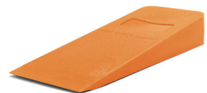
FELLING WEDGES 505 69 47-03