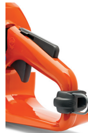
EYELET 578 07 71-01