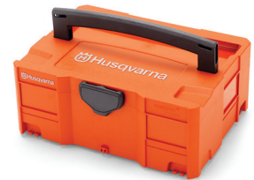
HUSQVARNA BATTERY BOX S 585 42 87-01