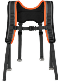
HARNES 593 83 76-01