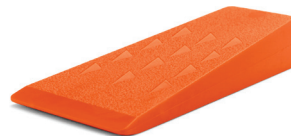
FELLING WEDGES 505 69 47-02