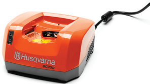
HUSQVARNA CHARGER QC330 967 09 14-01