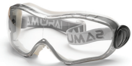
PROTECTIVE GLASSES, GOGGLES 544 96 39-01