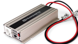
HUSQVARNA INVERTER VI600F 967 62 85-01