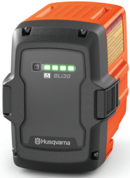
HUSQVARNA BATTERY BLI30 967 93 77-01