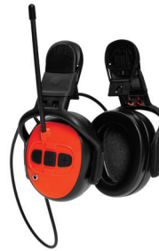
HEARING PROTECTION WITH FM RADIO 578 27 49-02