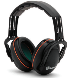
HEARING PROTECTION 505 66 53-04