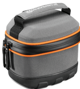
HUSQVARNA BATTERY BAG 585 37 18-01