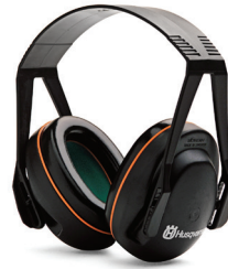
HEARING PROTECTION GARDENER 505 69 90-12