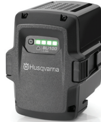
HUSQVARNA BATTERY BLI100 967 09 18-01