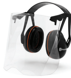
HEARING PROTECTION WITH VISOR, GARDENER 505 66 53-60