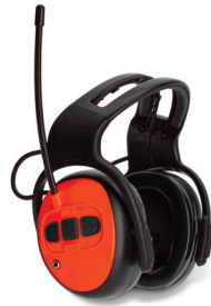
HEARING PROTECTION WITH FM RADIO 578 27 49-01