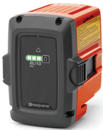
HUSQVARNA BATTERY BLI10 967 09 16-01