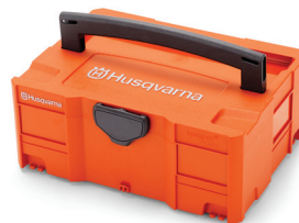
HUSQVARNA BATTERY BOX S 585 42 87-01