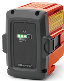
HUSQVARNA BATTERY BLI20 967 09 17-01