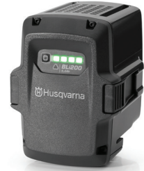
HUSQVARNA BATTERY BLI200 967 09 19-01