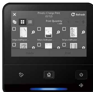
5-inch colour touch panel

When using Private Charge Print, you can easily select and delete the documents viewing the thumbnails shown on the panel. Convenient for saving time and waste.