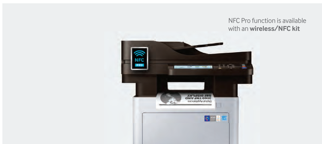
NFC Pro function is available with an wireless/NFC kit