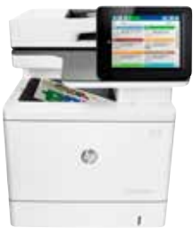
HP Color LaserJet Enterprise MFP M577dn

Ideal for enterprises and medium businesses that need a secure, highly productive, energy-efficient colour MFP.