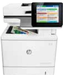
HP Color LaserJet Enterprise MFP M577f