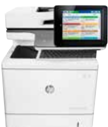
HP Color LaserJet Enterprise Flow MFP M577z