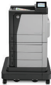
HP Color LaserJet Enterprise M651xh Printer