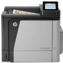
HP Color LaserJet Enterprise M651dn Printer

Performance you can count on: high-volume, professional-quality, two-sided colour documents with outstanding reliability. Efficient one-touch printing and mobile printing options plus simple management help you be productive wherever work takes you.