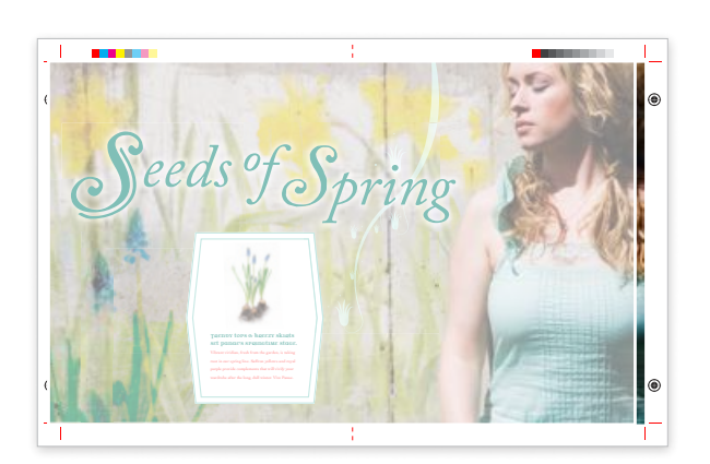
Oversize Output for 297 x 432 bleed

Depending on your needs and budget, you can go with the all-in-one Professional Finisher and get stacking, stapling, hole punching, booklet making and v-folding; or start with the Office Finisher LX and get stacking and stapling with the flexibility to add separate hole punching, creasing and stapling capabilities as your workload dictates.