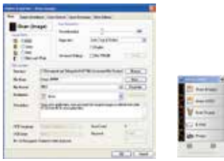
The Button Manager V2 main screen

Button Manager V2 makes it easy for you to scan and send your image to your favorite destinations with a press one button. Now the new version comes with an innovative feature to let you scan and automatically upload the scanned document to popular cloud repositories such as Google Docs, Microsoft SharePoint, or FTP. In addition, the iScan feature allows you to insert the scanned image or recognized text after optional OCR (Optical Character Recognition) process to your text editor such as Microsoft Word to get your job done easily and quickly.