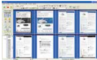
The AVScan X main screen

-The Intelligent Document Management Tool