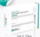
1ml X 10ea