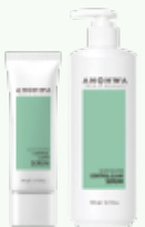
Capacity 50ml / 500ml

Melaleuca Alternifolia (Tea Tree) Leaf Oil Pore Contraction