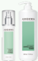
Capacity 140ml / 1000ml

Melaleuca Alternifolia (Tea Tree) Leaf Oil Pore Contraction