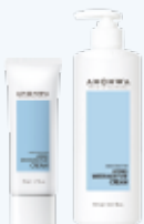
Capacity 50ml / 500ml

Use morning and night as required. After toner use, apply generous amount gently onto the face.