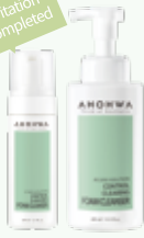
Capacity 150ml / 480ml