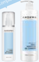
Capacity 140ml / 1000ml