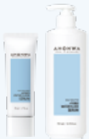
Capacity 50ml / 500ml

After cleansing, moisten a cotton pad with toner and smooth gently onto face or spray onto face.