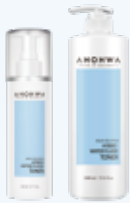
Capacity 140ml / 1000ml

Take suitable amount onto dampened hand to foam and apply on face in a gentle circular motion. Rinse thoroughly with lukewarm water.