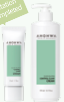
Capacity 50ml / 500ml