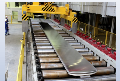
General Transport & Welding