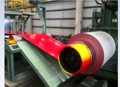
Coating & Galvanizing