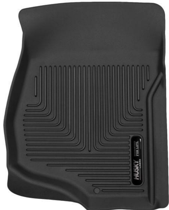
RIGHT OR PASSENGER