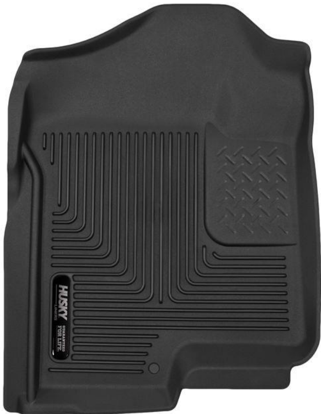
LEFT OR DRIVER

Your liners are made from an engineering resin that is lightweight and extremely tough and durable. The easiest way to clean your liners is with a damp cloth or sponge and soap and water. Windex®, 409® and ArmorAll® type cleaners work as well.