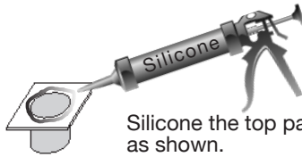
Silicone the top part of the waste outlet, as shown.

Installation to be by a licensed plumber and in accordance with AS/NZS 3500.2. NOTE: More information can be found at lauxesgrates.com.au or YouTube.