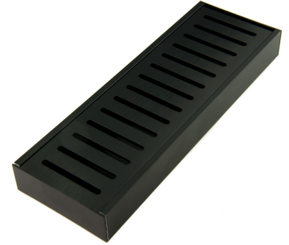
Standard Floor Grate (Midnight) PRODUCT CODE: LCMFGRATE For indoor use only.