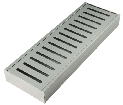
Standard Floor Grate PRODUCT CODE: LCFGRATE For indoor/outdoor use.