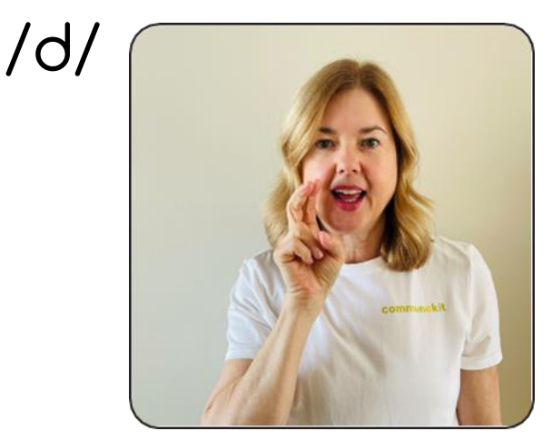
Same movement but with two fingers to show the voice is turned on.