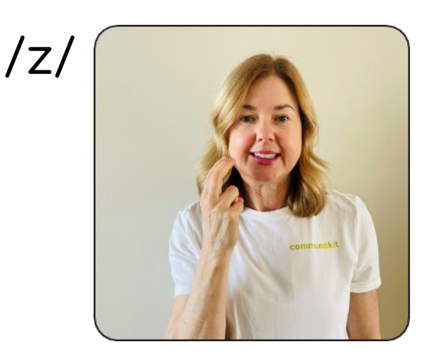
Same movement but with two fingers to show the voice is turned on.

Drag an index finger in front of closed teeth to show how the tongue tip is behind the teeth while air blows over it and through the front teeth.