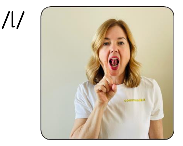
Hold an index finger straight up to show how the tongue tip is held on the ridge while the voice is turned on.

Hold an index finger beside the nose to show how the tongue tip is held on the ridge while the sound vibrates through the nasal cavity.