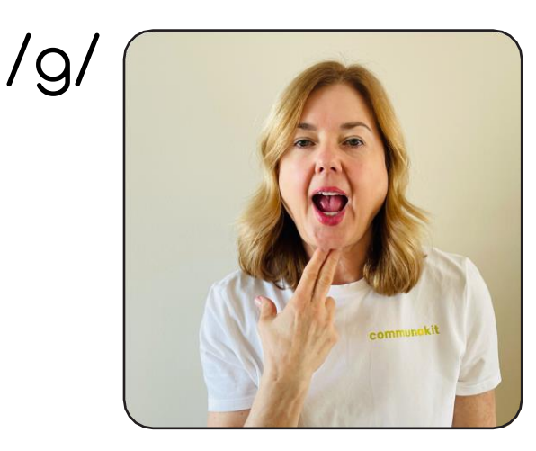
Same movement but with two fingers to show the voice is turned on.

Push an index finger upwards under the jaw to show how the back of the tongue touches the roof of the mouth.