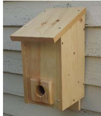
Convertible Roost Birdhouse (UNS-AHC2435)