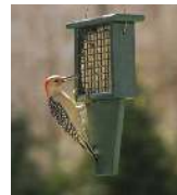
Recycled Composite Plastic Suet Feeder

Suet Feeders - Available in different sizes to hold one or more suet cakes. Several models are available including caged or weight based squirrel proof, upside down, or attached to a hopper feeder.