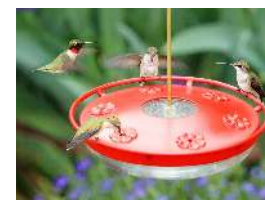
Aspects Hummingbird Feeder ASP-441

If you'd like to see hummingbirds even more, consider adding a hummingbird swing close to their feeder. They will happily perch on these to rest... and defend their feeders. It's also important to provide water for these beauties, so a birdbath or mister would be a welcome addition. I'm looking forward to welcoming them back!