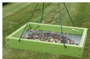
Going Green Platform Feeder, Green (WL-32325)