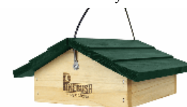
Upside Down Suet Cake Feeder