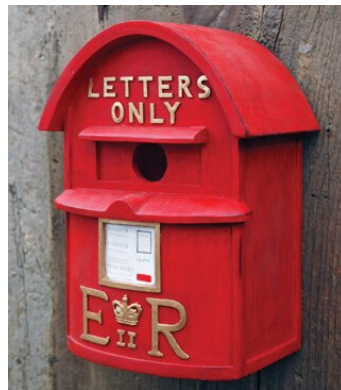
English Postbox Birdhouse (KIN-XBC-LTBX-D)