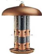
Top Flight Copper Triple Tube Feeder

Cylindrical Tube Feeder - A cylinder shaped feeder which would hang from a branch, bracket or pole hook. Usually has two or more feeding ports unless it is made for clinging birds only.