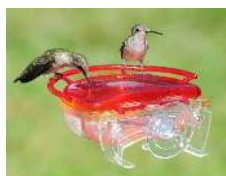
The Gem Window Hummingbird Feeder

Fly-through Feeder - A feeder with a base and roof, but no side walls.