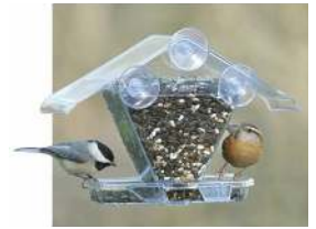
Transparent Window Cafe Feeder (ASP-155)

Deck railing mounts and clamps are also something to take into consideration, especially if you have a walkout basement and want to view the birds from the main living area of your home.