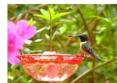
Aspects HummBlossom Rose, 4oz.

Hummingbird Feeders - These feeders are made of glass or plastic and are designed to hold nectar.