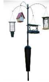
Sequoia Squirrel Proof Pole System JH-SEQUOIA