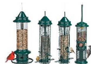
Brome Buster Squirrel Proof Feeders

Squirrel Proof/Resistant Feeders - Feeders that are weight based designed to close when the squirrel's weight is applied.