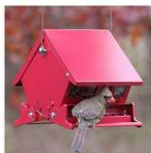
Mini Absolute II Squirrel Proof Hopper Bird Feeder

Bird feeders come in many shapes and sizes. Here are some styles to consider.