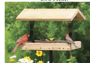
Cedar Fly-Thru Feeder

Cylindrical Tube Feeder - A cylinder shaped feeder which would hang from a branch, bracket or pole hook. Usually has two or more feeding ports unless it is made for clinging birds only.