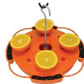
Ultimate Oriole Feeder (SE-905)

There's nothing like watching a hummingbird dart through your garden in search of colourful tubular shaped flowers. They are especially drawn to red, pink and orange flowers. Hummingbirds are also attracted to hummingbird nectar feeders. These little jewels are used to feeding close to the ground, so their feeders can be placed on shorter hooks in gardens or planters. Window feeders are another option if you want to see them up close! Hummingbirds are very territorial, so if you can place a few feeders out of sight of each other, you may have the opportunity to view more than one hummingbird family! The most functional feeders for hummingbirds are saucer shaped models that include an ant moat. It's important to keep their nectar fresh, so filling a hummingbird feeder to the brim isn't necessary. Their tongues are twice as long as their beaks, so you don't need to worry if the nectar isn't filled to the top. Once you notice the nectar has become cloudy in hummingbird and oriole feeders, it's time to refresh.