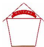
Hummingbird Swing Welcome POPWELCOMERED