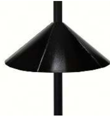
Squirrel Defeater Super Snap-On Pole Baffle (SE-SQ86)