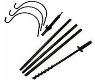
80-Inch Heavy Duty Feeder Pole Set w/3 & Twist Base (ETM-FP5TX-1)

Squirrel Stopper Pole Systems are an excellent choice to keep the squirrels and raccoons away from your feeders. These systems come with a solid auger, pole and baffle. To deter the squirrels from jumping to the feeders, place these 10 feet away from fences, trees, or deck railings.