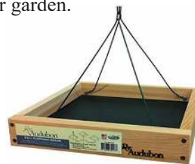
Audubon 3-in-1 Platform Feeder (WL-NAPLAT2)