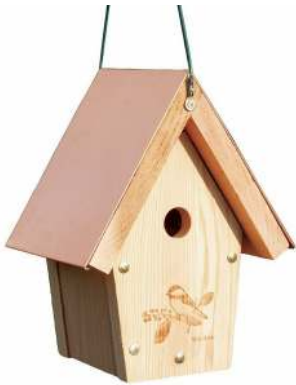
Coppertop Chickadee/Wren Bird House (WL-COPCH)

Perhaps you moved the feeders closer to your house for ease of filling during the winter months. If so, you can now spread them out in different areas of your yard. Try to place them close to trees or shrubs for the birds to take shelter in case of predators. Rake up any seeds or shells that have accumulated over the winter and discard. You can also do some maintenance on your bird houses. You want to make sure they're clean and ready for nesting in case birds have taken shelter in them over the winter. If the bird house doesn't have an easy opening for cleaning, partially take the house apart with a screwdriver. Remove any debris or old nesting material. Clean the houses with hot water and mild dish detergent, making sure to rinse well and air dry completely. You will also want to check the inside of the bird house for any splinters or protruding screws or nails. Check to ensure the hinges are tightened. When mounting your bird house, position it so the opening is facing away from the direction of prevailing winds.