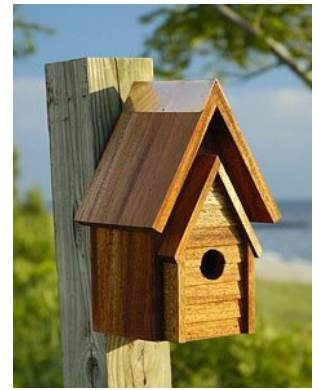
Heartwood Wrenal House Birdhouse (HW-109F)

To help the birds along you may want to offer some nesting material. Natural materials such as dead twigs, pine needles, moss, as well as grass and leaves that haven't been treated with pesticides can be left in small piles, open baskets or added to a suet feeder. All of these materials should be cut into 2 to 4 inch pieces. Alpaca fur and natural cottontail nest building material is also safe to put out. Do not put out dryer lint as it may contain chemicals or fragrance from dryer sheets or detergent. Human hair is also too fine to put out as it could tangle around the birds' feet. Feathers containing dye and coloured yarn are also discouraged.