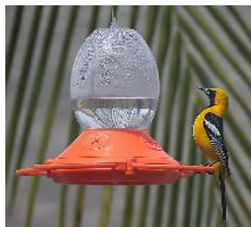
Opus Oriole Feeder 32oz. (WS-449-2)