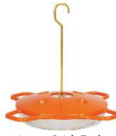
Aspects Oriole Feeder (ASP-361)