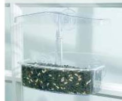
Droll Yankees Observer Window Feeder (DY-OWF)