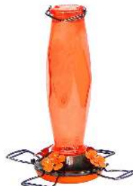
Prism Oriole Feeder (STK-38290)