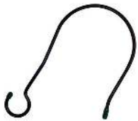
12 Inch Branch Hook, Black

Sun or shade you may ask? Birds are attracted to feeders in the sun or shade as long as they don't feel vulnerable to predators. If you live in a warm climate and you have shade trees in your yard, it would be more comfortable for the birds to feed in that area. Otherwise, placement close to the cover of trees, shrubs or bushes is always a good idea. Shepherd hooks are a good choice if you're just beginning, or adding a separate station for orioles or hummingbirds. These are available in double or single adjustable height models with a solid base to go into the ground. Single shepherd hooks in various sizes are also available. Whatever you choose, make sure the hooks are sturdy enough to hold the weight of your feeder/feeders. S hooks and branch hangers can also be used in trees or bushes and come in sizes from 1.5 inches to 54 inches.