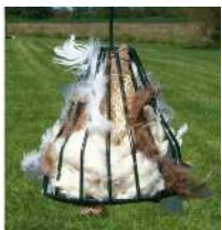
Birdie Bell with Nesting Material (SE-WF91010)

It's also a good idea to put out dried eggshells to help female birds replace calcium lost from egg laying. To do this, wash the egg shells and put them in a 250 degree oven for 20 minutes. Crumble and place them on a platform feeder or on the garden floor. By following these steps you will be able to watch the birds thrive in your garden.