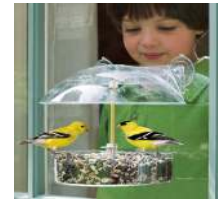
The Winner Multi-Purpose Window Feeder (DY-W1)