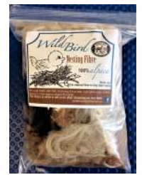
Bird Nesting Fibre With Alpaca Fleece (LSFF-1)