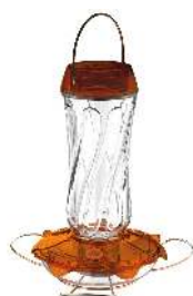
Classic Oriole Feeder (DY-C-30B)

You can welcome orioles with a variety of feeders as they like to choose from a diverse menu. Their favourite foods include nectar, grape jelly, oranges, red grapes (cut in half is best), mealworms and fruit flavoured suet. Nectar can be made with ¼ cup plain white table sugar to 1 cup boiling water. Stir to dissolve the sugar and cool. You may also purchase powdered or ready-to-use nectar. There are many styles of oriole feeders to choose from to accommodate their various food preferences! Separate feeders are available for nectar, jelly, oranges, suet, and mealworms, or you can choose the Ultimate Oriole Feeder which provides areas for nectar, grape jelly and fruit.