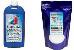
Feeder Fresh Seed Preservative, 8 oz / 16oz. (SAL-FF-16)

Perhaps you moved the feeders closer to your house for ease of filling during the winter months. If so, you can now spread them out in different areas of your yard. Try to place them close to trees or shrubs for the birds to take shelter in case of predators. Rake up any seeds or shells that have accumulated over the winter and discard. You can also do some maintenance on your bird houses. You want to make sure they're clean and ready for nesting in case birds have taken shelter in them over the winter. If the bird house doesn't have an easy opening for cleaning, partially take the house apart with a screwdriver. Remove any debris or old nesting material. Clean the houses with hot water and mild dish detergent, making sure to rinse well and air dry completely. You will also want to check the inside of the bird house for any splinters or protruding screws or nails. Check to ensure the hinges are tightened. When mounting your bird house, position it so the opening is facing away from the direction of prevailing winds.