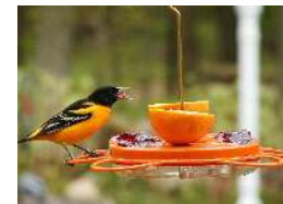
12 oz. Oriolefest Bird Feeder

Oriole Feeders - Oriole feeders will hold nectar, fruit such as oranges or grapes, or grape jelly. Some models include more than one feature.