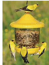
Clingers Only Bird Feeder SE-CLING