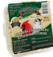
Armstrong Birder's Choice Suet Cake AMC-82004