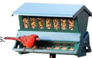
Absolute II Squirrel-Proof Bird Feeder WL-7536