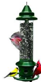
Brome Buster Plus Squirrel Proof Feeder - BRM -1024