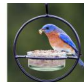
Mosaic Birds Humble Bird Feeder, Clear -COUR-M045200