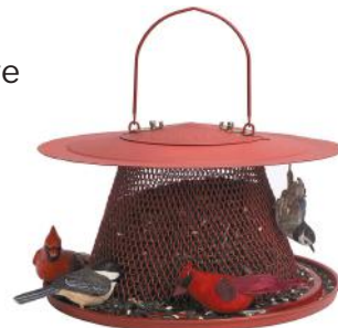
Red Cardinal Wild Bird Feeder -NONO-C00322