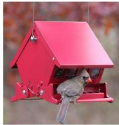
Absolute II Squirrel Proof Hopper Bird Feeder- WL-7458