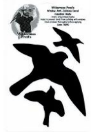
Wilderness Fred's Window Anti-Collision Decal, 2PK