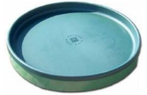
3-in-1 Heated Bird Bath, Green - FI-GBD-75

Minimize Pesticide Use: Reduce or eliminate the use of pesticides and herbicides in your yard, as these chemicals can be harmful to birds and the insects they rely on for food.