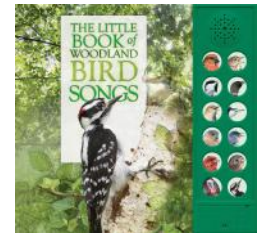
The Little Book of Woodland Bird Songs