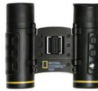
National Geographic 8x21 Binoculars NATG-80-10821CP