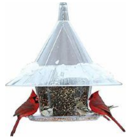
Arundale Sky Cafe Bird Feeder AR-360

Exploration and Trial-and-Error: Young birds, in particular, are curious and may explore their surroundings in search of food. They might stumble upon a bird feeder while exploring and learn to associate it with a food source.