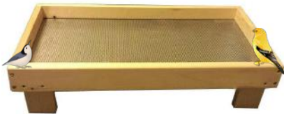
Handmade Ground Feeder UNS-AHC2433

Clean and Fresh Water: Offer a clean and reliable water source for birds to drink and bathe. A birdbath or shallow dish with fresh water can be a valuable resource, especially during dry periods.