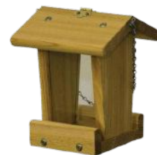
Mini Mixed Seed Feeder UNS-STOVMINI1

Bird migration is an astonishing display of nature's resilience and adaptation. It continues to captivate and inspire me.