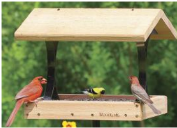
Cedar Fly-Thru Feeder WL-ATFLY

Social Learning: Some bird species learn from each other and follow the behavior of fellow birds. If one bird discovers a bird feeder, it may share this information with its flock or other birds, leading to increased visitation to the feeder.