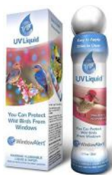
Window Alert UV Liquid 1 oz SE-WINDAUV

Be Mindful of Cat Predation: Keep pet cats indoors or supervised on leashes during migration. Cats are a significant threat to migratory birds, especially when birds are tired and vulnerable during their journey. The Prey Saver Cat Collar is a great way to help our birds.