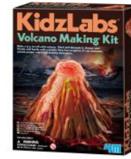
4M Volcano Making Kit TS-3431