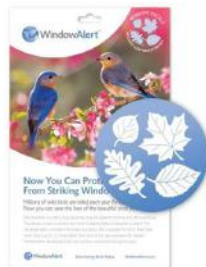
Window Alert Leaf Medley Transparent Bird Strike Deterrent, 5PK