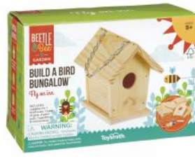
Build A Bird Bungalow TS-29535