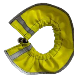
Prey Saver Cat Collar, Sunshine Yellow CKF-01660