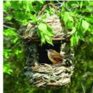
Acorn Hanging Roosting House SE-939