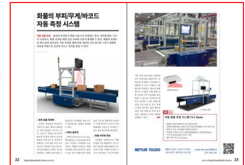
Ad + article(1P)