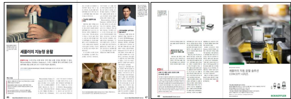
Examples: Mettler Toledo, Schaeffler

Price: 5,410 Euro * Format 2: 4 pages Recipients: 4.000 + online