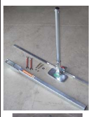
Step I: Place contents of box on floor or table. Place handle over riser tube with decal facing up and insert short 1/2" - 22 bolt.