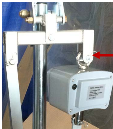
Assembled unit back view.