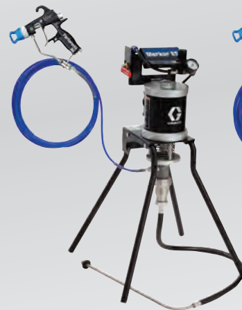
30:1 airless stand mount