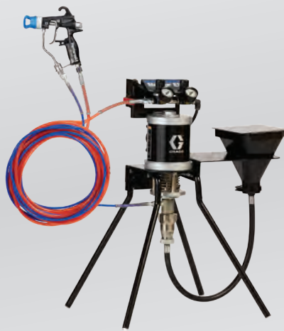
30:1 air-assist stand mount with hopper