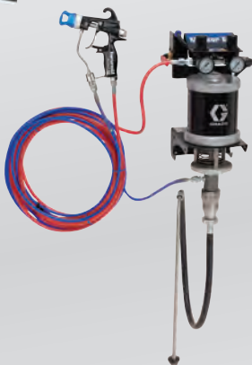
30:1 air-assist wall mount