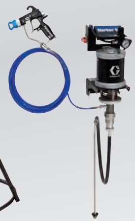
30:1 airless wall mount