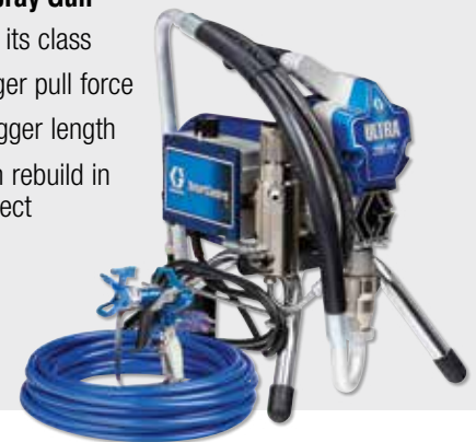
Ready to Spray: Complete with Contractor PC Spray Gun, 15 m Blue Max™ II hose, and RAC X SwitchTip™