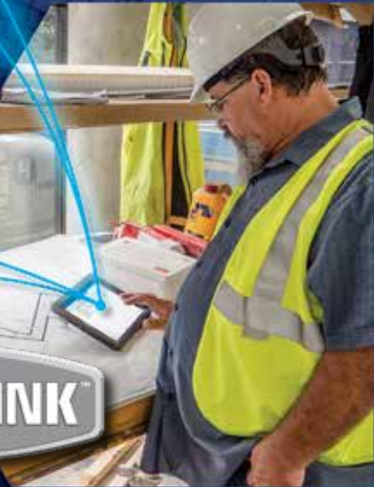
MANAGERS ARE ABLE TO UNDERSTAND JOB PROGRESS