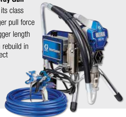
Ready to Spray: Complete with Contractor PC Spray Gun, 15 m Blue Max™ II hose, and RAC X SwitchTip™