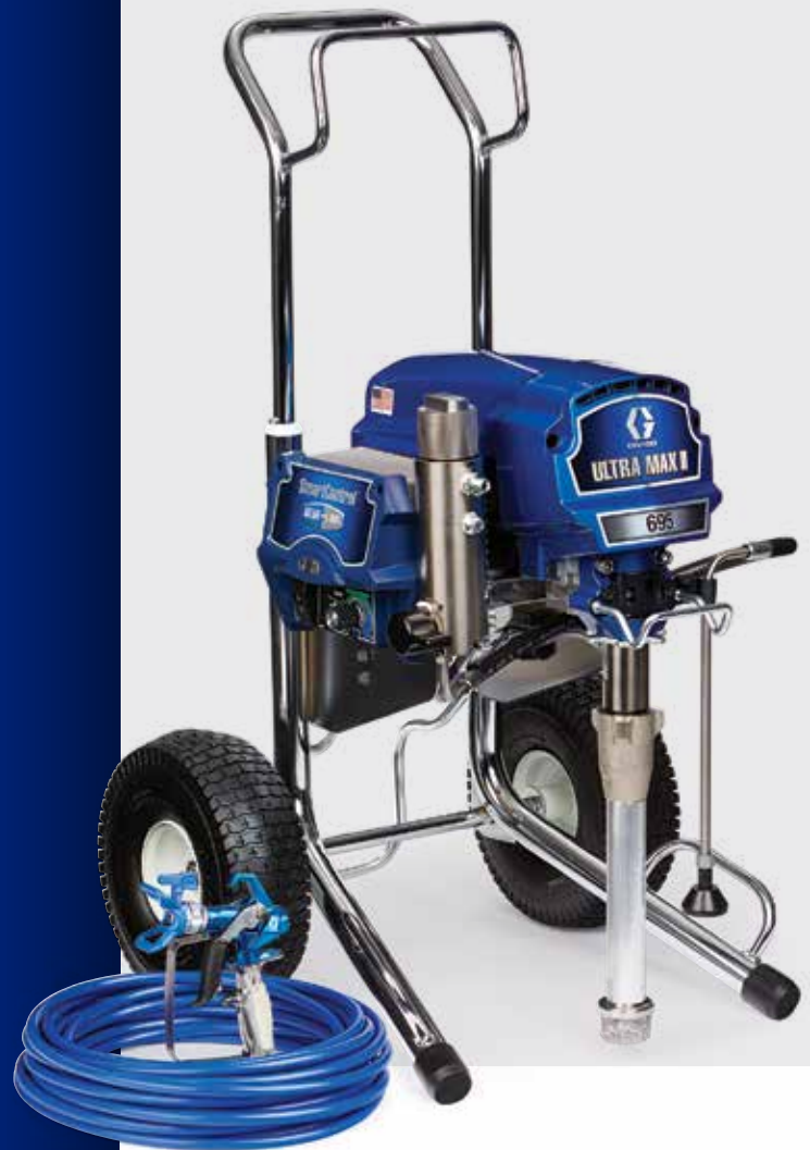
Ready to Spray: Complete with Contractor PC Spray Gun, 15 m Blue Max II hose, and RAC X SwitchTip