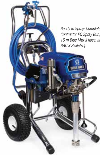
Ready to Spray: Complete with Contractor PC Spray Gun, 15 m Blue Max II hose, and RAC X SwitchTip