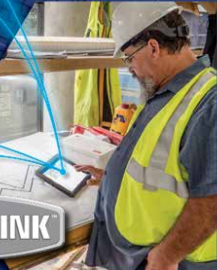
MANAGERS ARE ABLE TO UNDERSTAND JOB PROGRESS