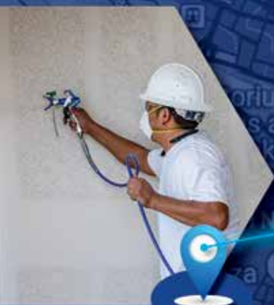
PAINTERS ARE ABLE TO MAXIMISE UPTIME

BlueLink combines the power of a mobile app with Bluetooth®-enabled Graco sprayers to provide real-time jobsite and sprayer information to improve the way you manage your business.