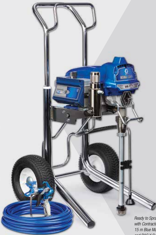
Ready to Spray: Complete with Contractor PC Spray Gun, 15 m Blue Max II hose, and RAC X SwitchTip