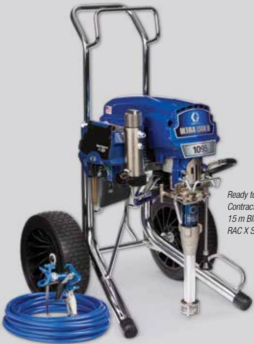
Ready to Spray: Complete with Contractor PC Spray Gun, 15 m Blue Max II hose, and RAC X SwitchTip