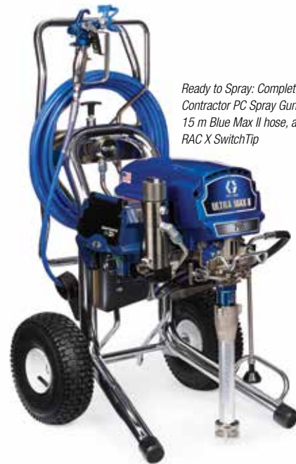
Ready to Spray: Complete with Contractor PC Spray Gun, 15 m Blue Max II hose, and RAC X SwitchTip