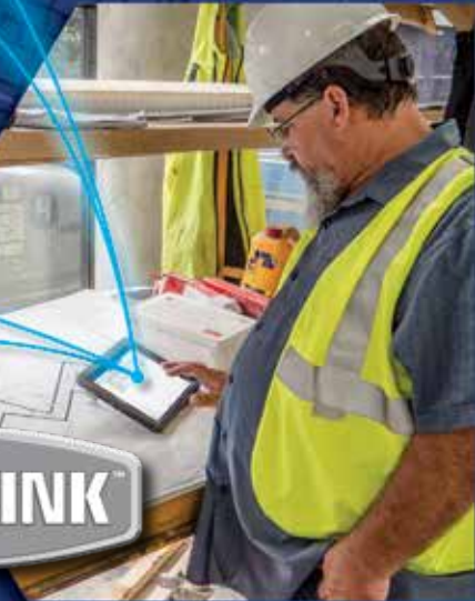
MANAGERS ARE ABLE TO UNDERSTAND JOB PROGRESS