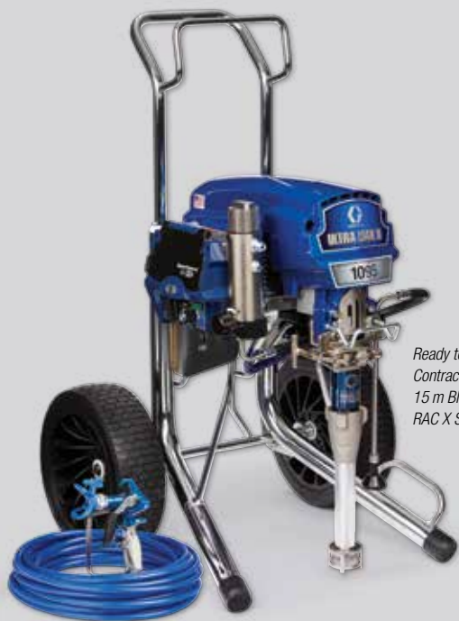
Ready to Spray: Complete with Contractor PC Spray Gun, 15 m Blue Max II hose, and RAC X SwitchTip