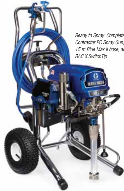
Ready to Spray: Complete with Contractor PC Spray Gun, 15 m Blue Max II hose, and RAC X SwitchTip