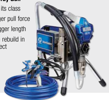
Ready to Spray: Complete with Contractor PC Spray Gun, 15 m Blue Max™ II hose, and RAC X SwitchTip™