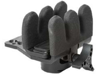
KJ86006 REAPER GRIP DIRECT MOUNT