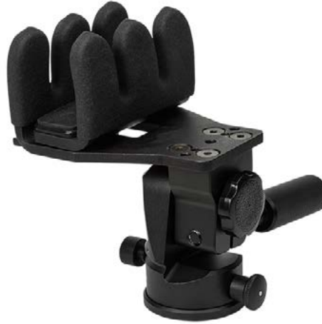
KJ86000 REAPER GRIP SYSTEM