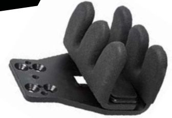
KJ86001 REAPER GRIP UPPER ASSEMBLY