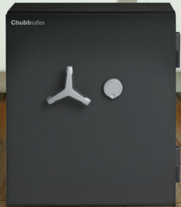
MODEL SHOWN: DUOGUARD 110 KEY LOCK