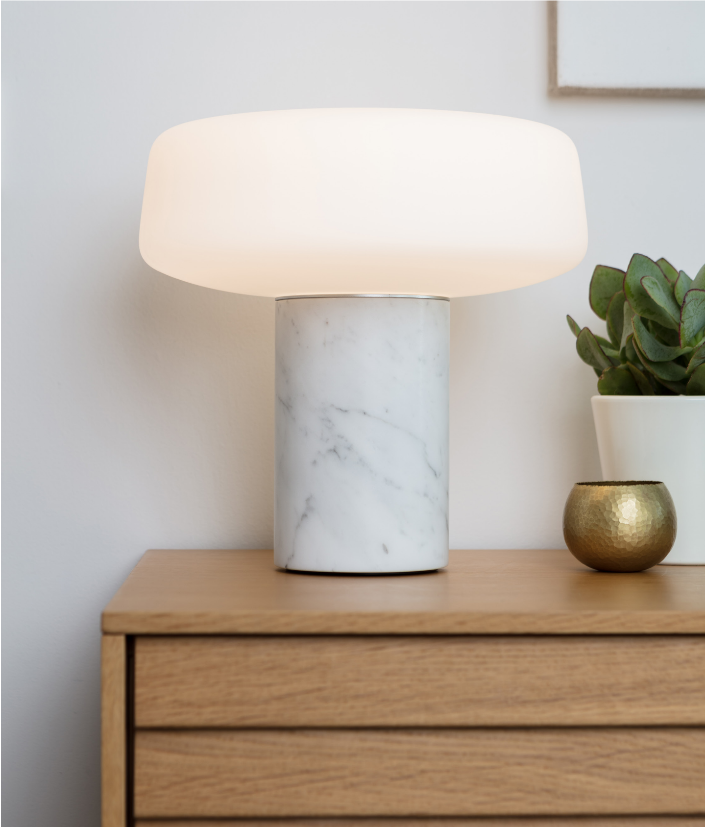
Solid Table Light by Terence Woodgate