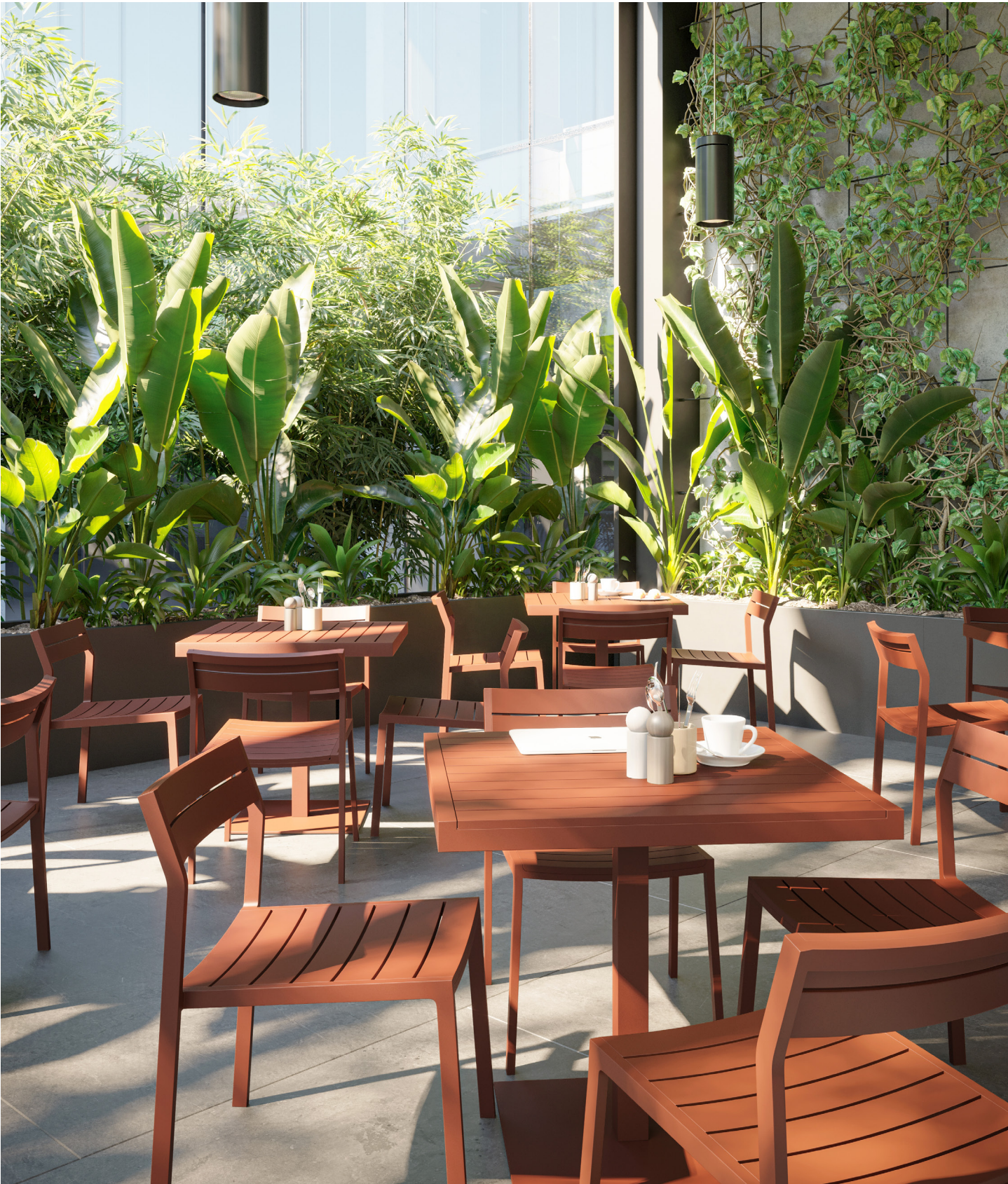
Eos Side Chair by Matthew Hilton