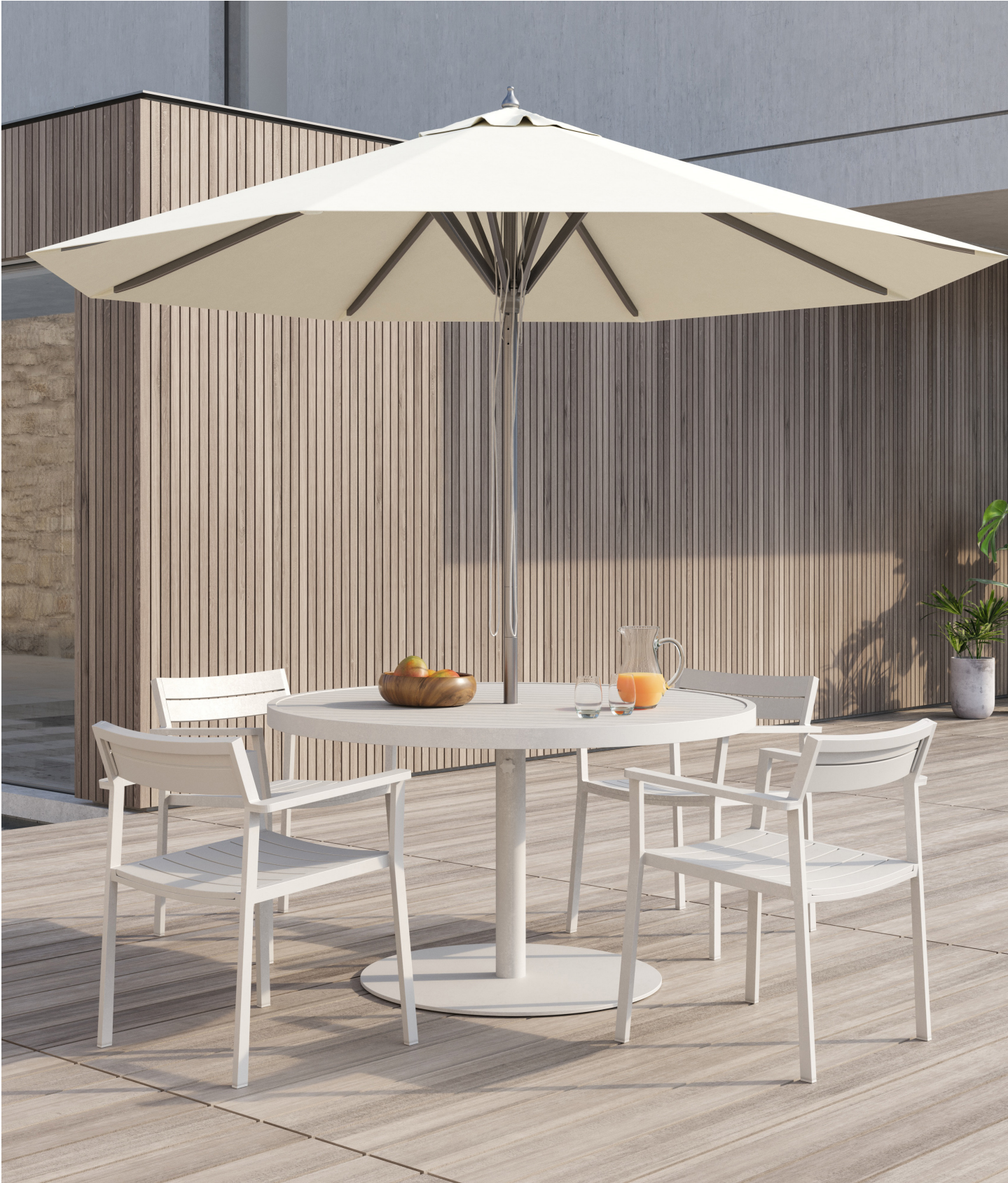
Eos Round Table by Matthew Hilton