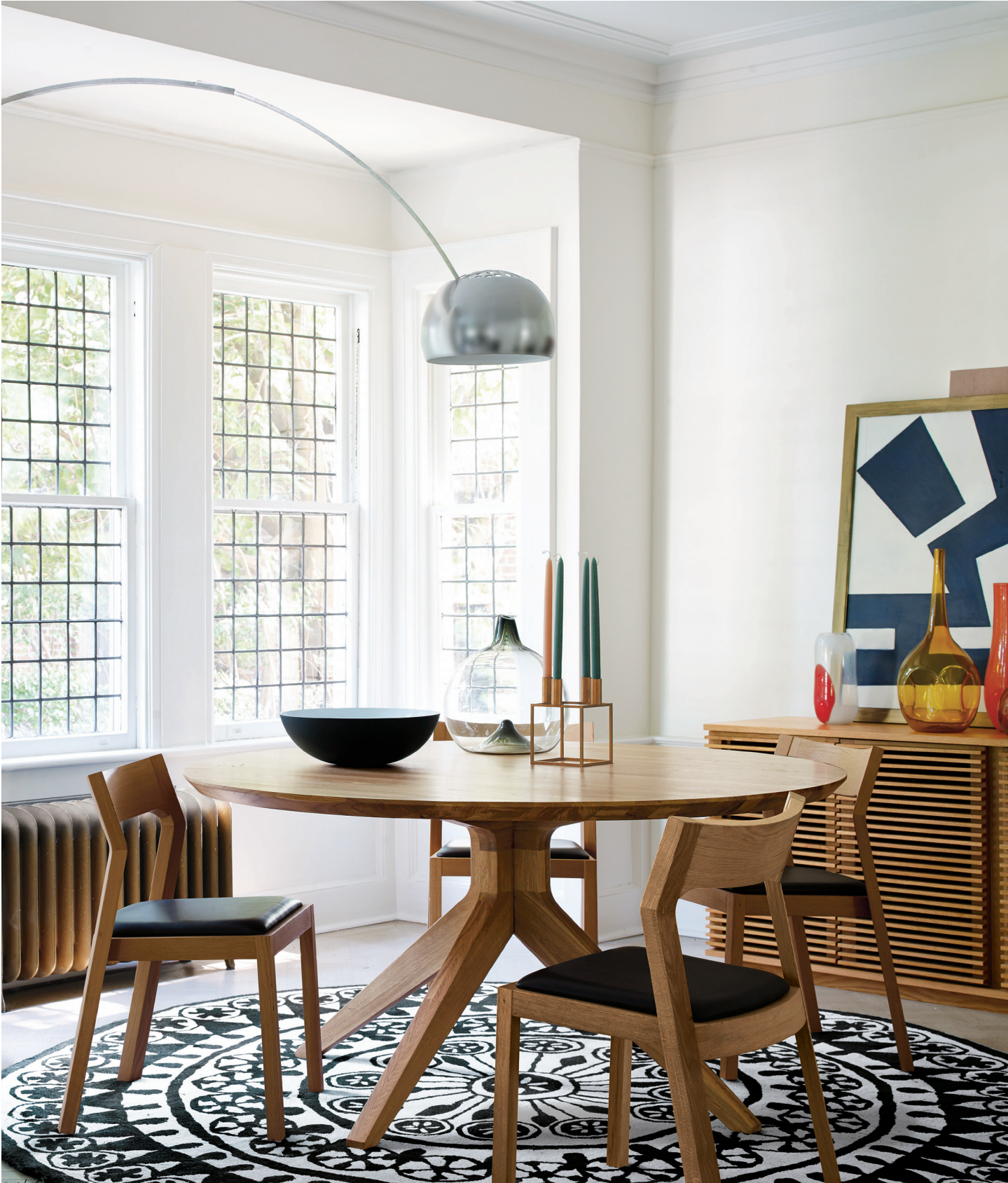
Cross Round Table by Matthew Hilton