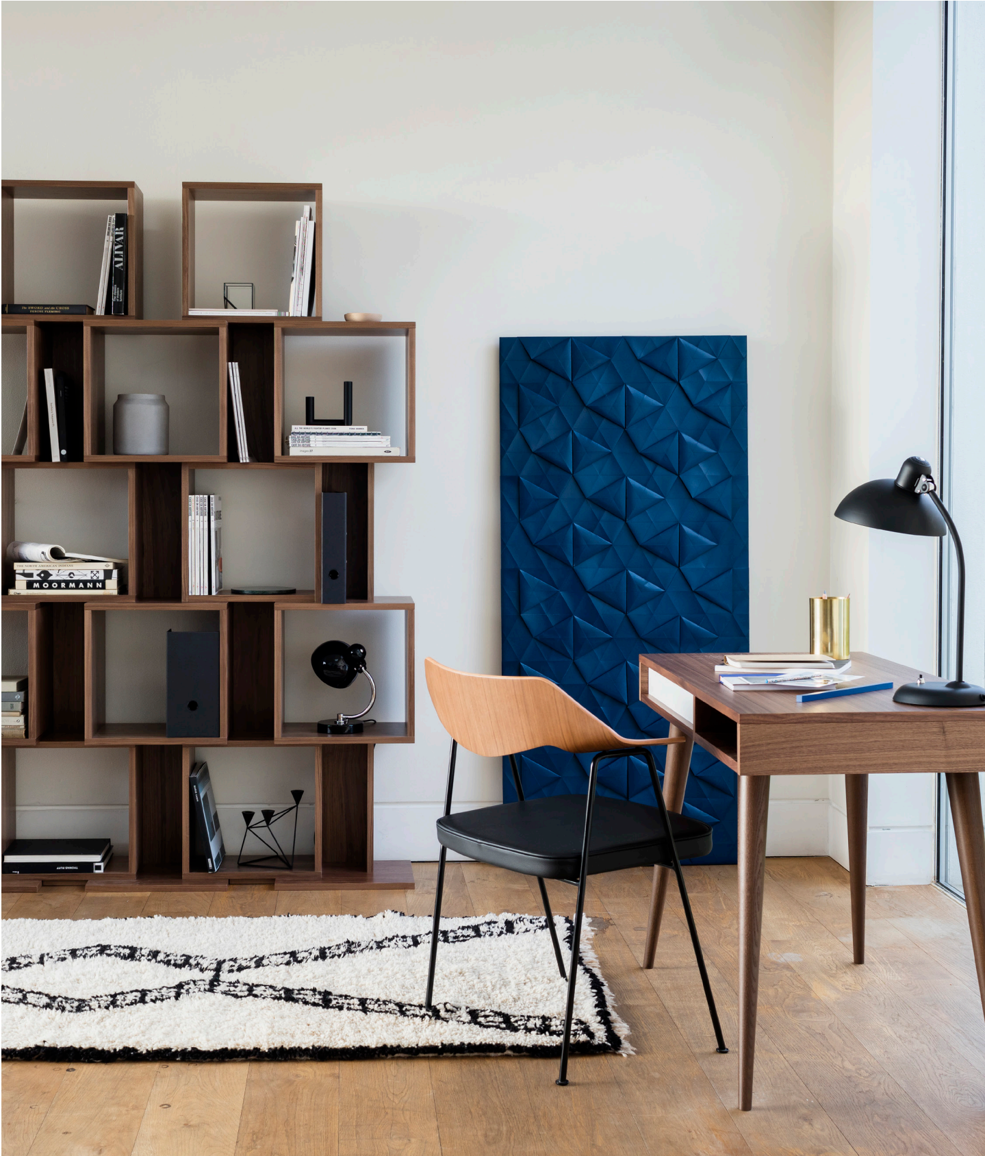
675 Chair by Robin Day