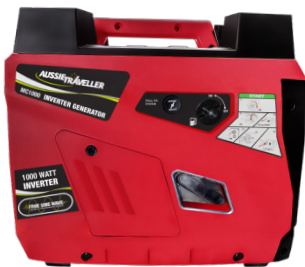
MC1000 INVERTER GENERATOR PART NUMBER: 265608001

The 4 strokes OVH, 1 phase engine on the MC Series is as quiet as a conversation with a sound rating of 59.5dB from 7m away at 1/4 load. The MC Series also comes with over voltage protection to protect your devices.