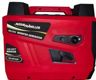
MC2300 INVERTER GENERATOR PART NUMBER: 265608002