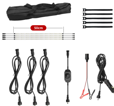
4 BAR LED STRIP LIGHT KIT PART NUMBER: 265504001