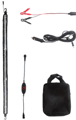
FLEXIBLE 1.2M 12V LED STRIP LIGHT PART NUMBER: 265504000

The 10 bar kit has 8 colours to choose from—Red, Green, Blue, White, Orange, Yellow, Cyan, Purple—while also featuring 6 pattern modes, Auto, Flash, Jump 1, Jump 2, Fade 1, Fade 2 with different speeds to choose from.