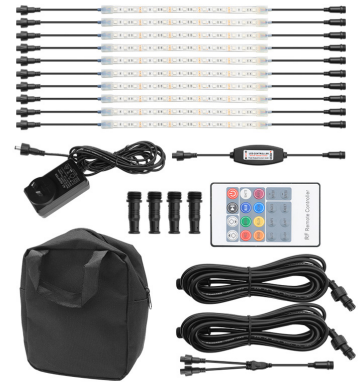
10 BAR LED STRIP LIGHT KIT PART NUMBER: 265504002