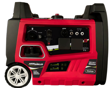
MC3500 INVERTER GENERATOR PART NUMBER: 265608003