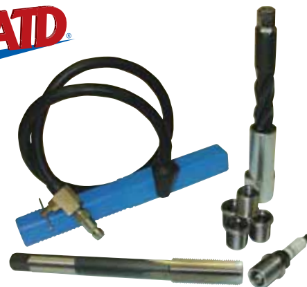
ATD-5400 Ford Spark Plug Insert Installer