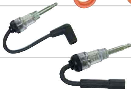
SG-23900 In-Line Ignition Spark Checker