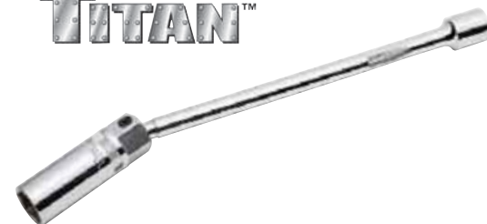
3/8" Drive 10" Long Swivel Spark Plug Socket Extensions