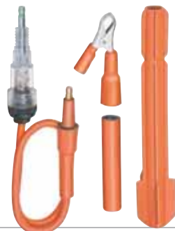
SG-23920 90° Boot, In-Line Ignition Spark Checker