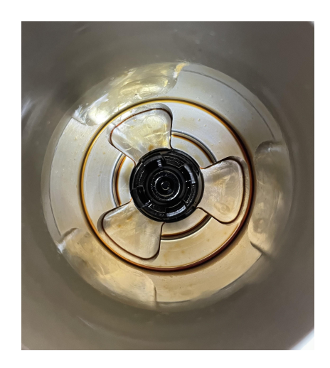
Oil filter cap after installing filter bypass valve.