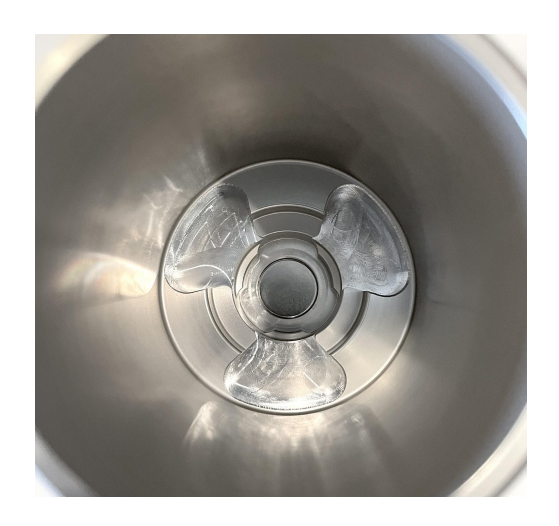
Oil filter cap before installing filter bypass valve.