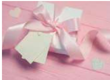
Single-Face Satin #9 Lt Pink