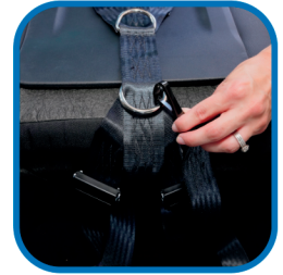
5. Disconnect bottom tether hooks from D-ring