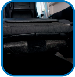
1. Fold seat and locate tether anchor. May have to remove fabric cover to gain access to bite of seat