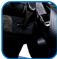
3. Connect central tether hook to lower vehicle anchor