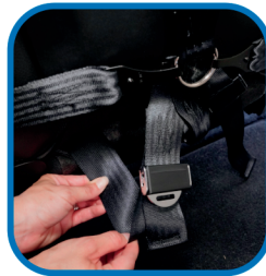
13. Tighten bottom tether hooks by pulling on loose webbing through tilt adjuster. Ensure it is fully tightened before proceeding to next step