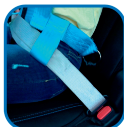
17. Buckle seatbelt low on the lap. Make sure seatbelt is in the locked position and secured as tightly as possible