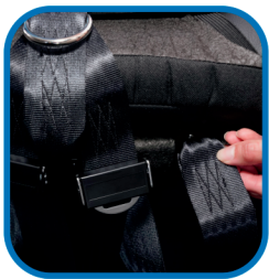
6. Feed bottom tether hooks through bite of seat