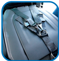
2. Lay mount over back of seat