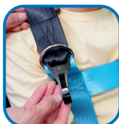
11. Starting from the top down, loop shoulder tether hooks through shoulder D-rings and lay strap over the back of the seat. Repeat this step for the opposite side