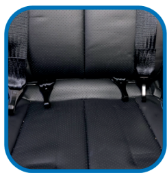
7. Fold seat up and pull bottom tether hooks fully through bite of seat