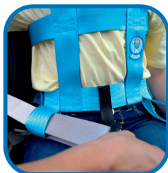
16. Thread vehicle seat belt through vest loops