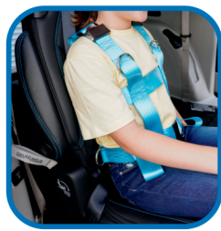
8. Properly seat the passenger