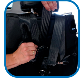
15. Tighten shoulder straps by pulling the loose webbing through the tilt adjuster