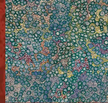
Wildflower Country Lyn Cheedy