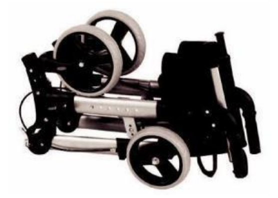
Figure 2. Assemble the front wheels by unfolding the rollator tightening the wheels into place using the fastening knobs. The front wheels should now be secured.

Figure 1. Carefully remove your Zip'r Rambler rollator walker from its packaging. The rollator will be folded as shown.