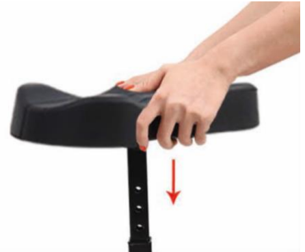
Figure 7. Insert the seat at your desired height locking it into place with the seat post pin.

Figure 6. Install the seat which is designed to be used with either the left or right leg.