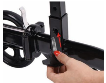
Figure 8. Tighten the clamp lever to secure the seat into place.

Figure 7. Insert the seat at your desired height locking it into place with the seat post pin.