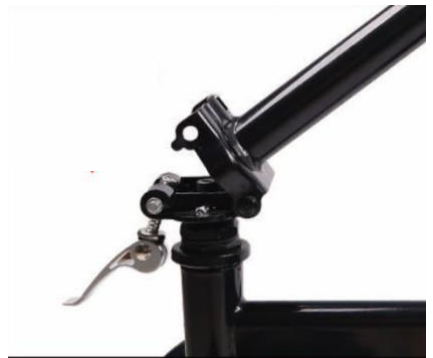
Figure 4. Secure the center frame hinge by connecting the front and rear frame sections by closing the center frame hinge.

Figure 3. Secure the steering column by pushing the clamp lever to the left which will allow the safety pin to lock into place. Raise the clamp lever upward into the "U" shaped slot and tighten by turning clockwise. Push the clamp lever down firmly to secure the steering column.