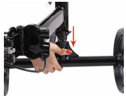
Figure 3. Secure the steering column by pushing the clamp lever to the left which will allow the safety pin to lock into place. Raise the clamp lever upward into the "U" shaped slot and tighten by turning clockwise. Push the clamp lever down firmly to secure the steering column.

Figure 2. Pull down on the guide pin ring and turn the front axle so that the guide pin ring is between the guide stops. Release the guide pin ring and your front axle is set in the proper position.