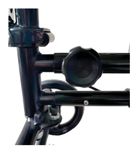
Figure 2. Install the brake cable clip to the lower mainframe.

Figure 1. Carefully remove your Zip'r Glider knee scooter from its packaging. Insert the mainframe into the rear frame of the knee scooter. Ensure that the lower mainframe clicks into place. Tighten the knob on the upper mainframe securely.