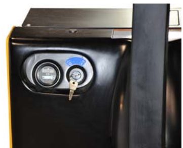
OUR METER BDI AND KEY STANDARD

Model - WPT45S only available with 685mm x 1220mm fork dimension