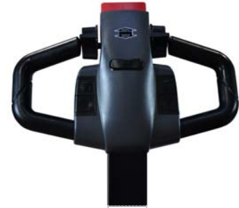
ERGONOMIC OPERATOR'S HANDLE