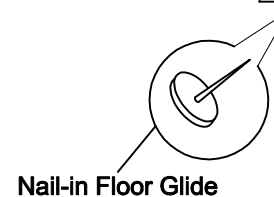
Nail-in Floor Glide