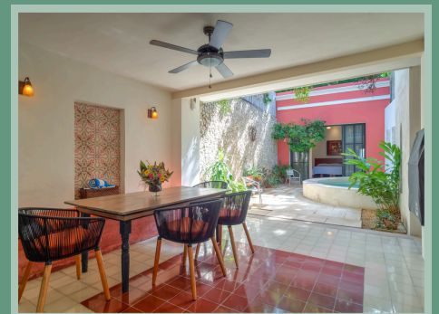
Annex house: Casa Koala