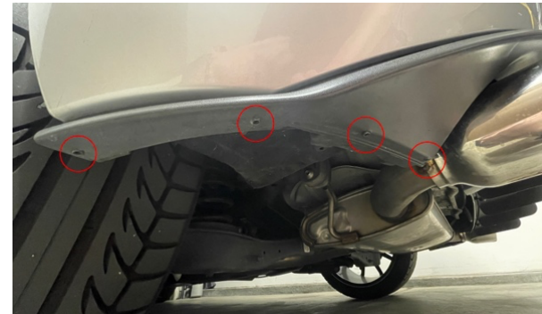
DRILLED MOUNTING HOLES

Starting on one side of the car, hold the Rear Spat in place and verify that the holes you just drilled line up with the holes in the Rear Spat. Then, using a Phillips Head Screwdriver, thread the supplied Stainless Steel Screws into the holes that you drilled in the previous step. Make sure you use a Washer between the Rear Spat and each Screw.