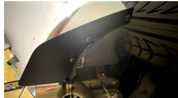
MOUNTED WITH SCREWS AND WASHERS