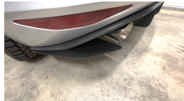
REAR SPAT INSTALLED

YOU'RE ALL SET! ENJOY YOUR NEW RENNWAGEN REAR SPATS! TAKE SOME PICS, TAG AND FOLLOW US ON INSTAGRAM @RENNWAGEN_USA!