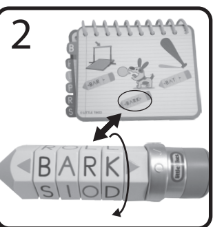
Pick a word to spell from the 100 Words Notebook. Spin the letter blocks until the word has been correctly spelled between the two blue arrows.