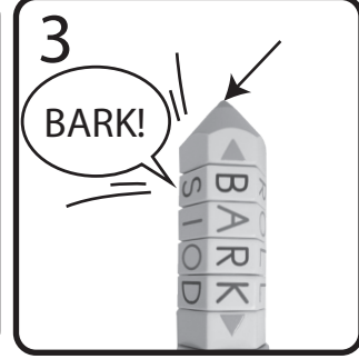
Press the pencil tip button to hear the word spelled and pronounced.

Note: The pencil will pronounce the words shown in the book. For words not shown in the book or misspelled, the pencil will prompt the child to try to pronounce it.