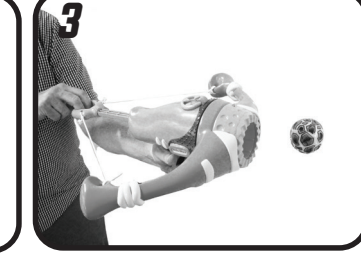
Turn the Bow a quarter turn to transform it into a Crossbow. To launch, simply pull the handle back and let go!

0819-0-E/INT Little Tikes Consumer Service 2180 Barlow Road Hudson, Ohio 44236