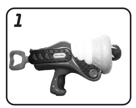
Holding the blaster in an upright position, insert a power pod.